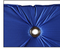
Cloud-Lite® Baffle 2800S-2065, Sailcloth with Grommet in Panel