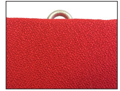
Cloud-Lite Baffle 2800F-2060-E Guilford Anchorage with Eye hooks