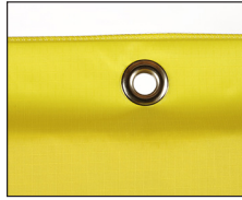
Cloud-Lite® Baffle 2600P-2065, PVC with Grommet in Flap