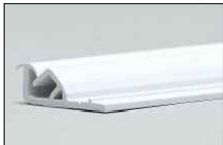
MASQUERADE/DESCOR AP TRACK